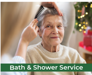
Bath & Shower Service