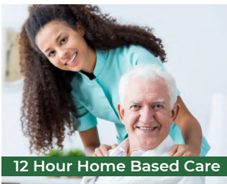
12 Hour Home Based Care